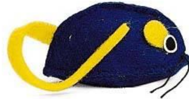
FELT MOUSE 1

This saucy creature is a mouse Most mothers won't let one in the house See, this one it has quite a tail, Each Girl Scout made one without fail. Take it home and help all week, and for good turns you must seek for every good turn that you do tie a knot in the yarn...make quite a few. Remember why each knot you tied and how much to help you really tried and then next week, please take your turn to tell us all, so we can learn... just what you did to help at home a ready helper you have grown!