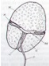
POND ORGANISM (Under a microscope)