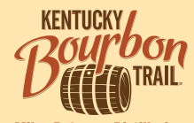
Miles Between Distilleries