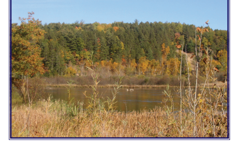
Manistee River Backwaters