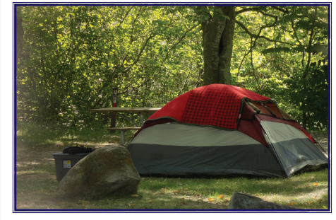
Red Bridge River Access